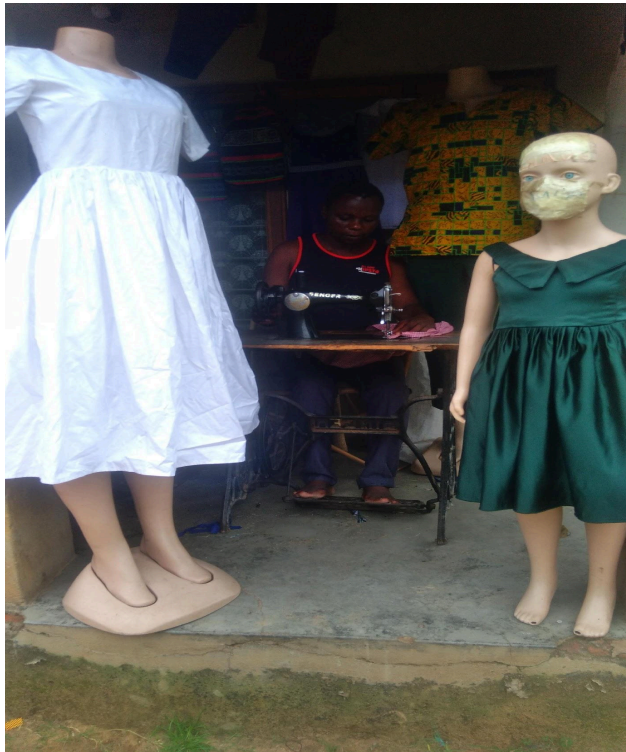
Women and Gir's dresses