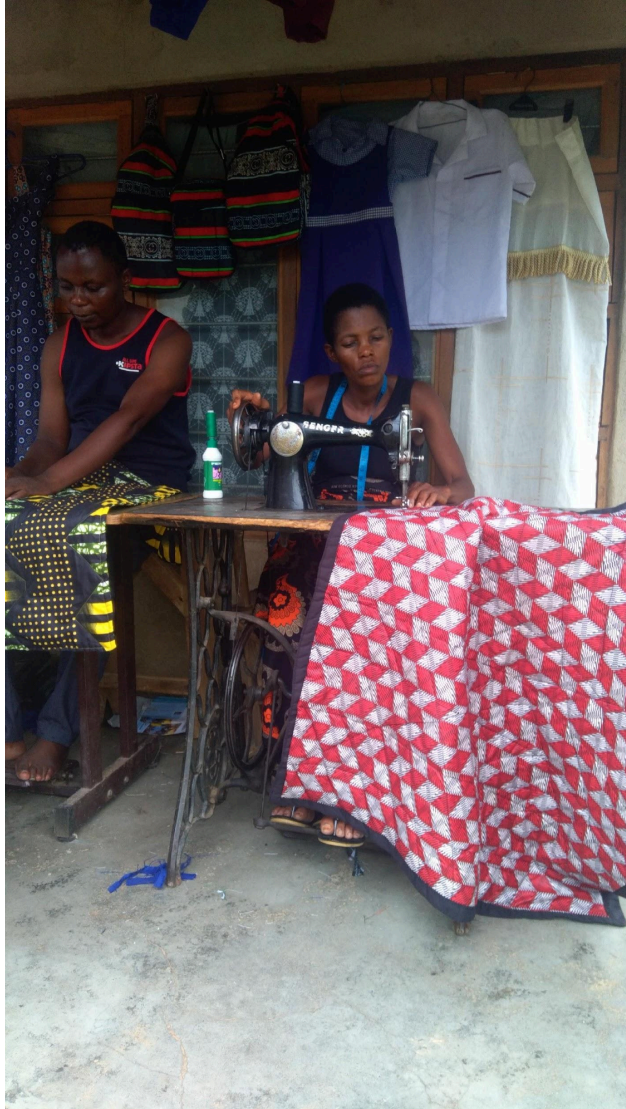
Place of work