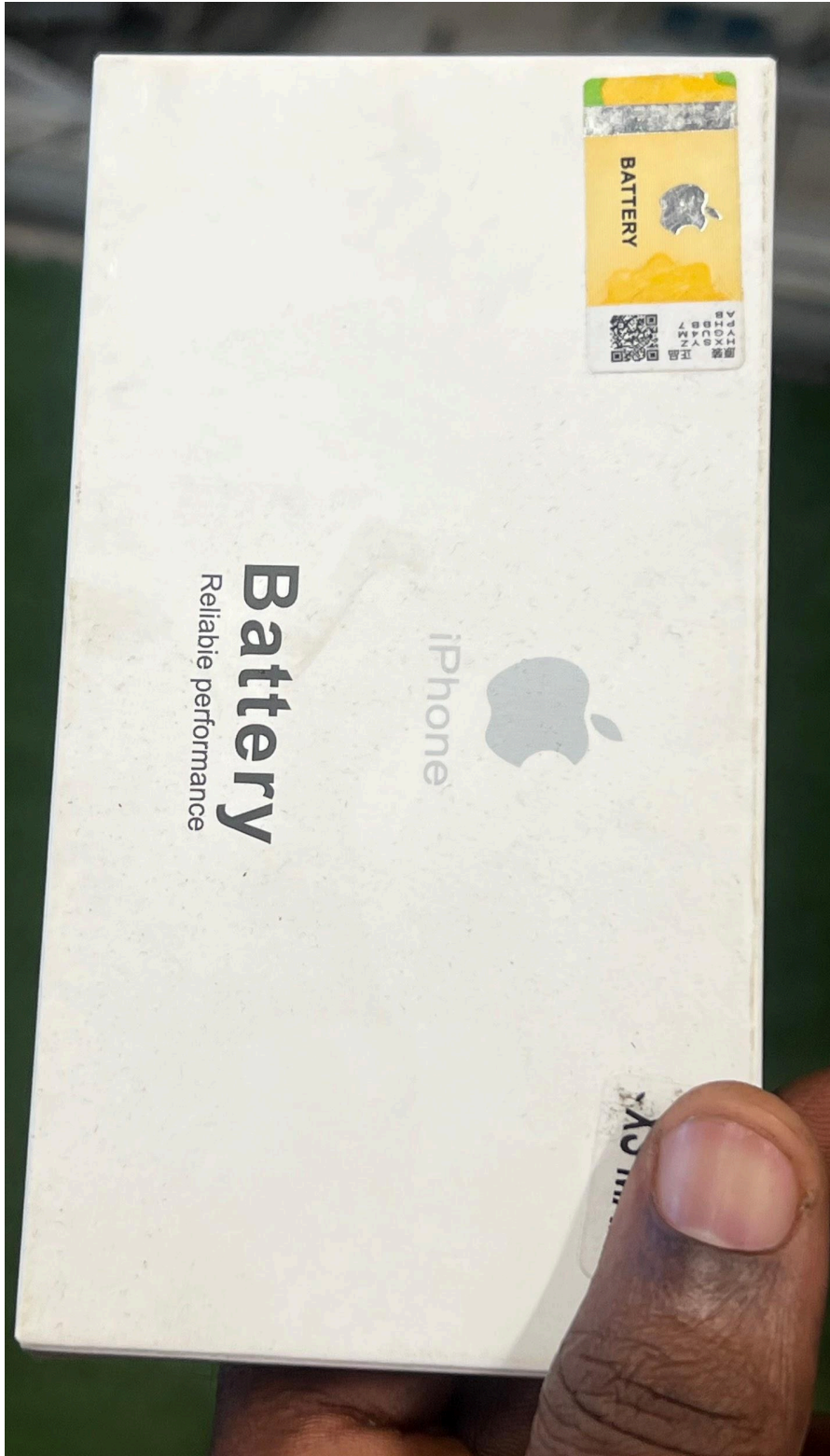
A sample of iPhone 7 Plus batteries I need