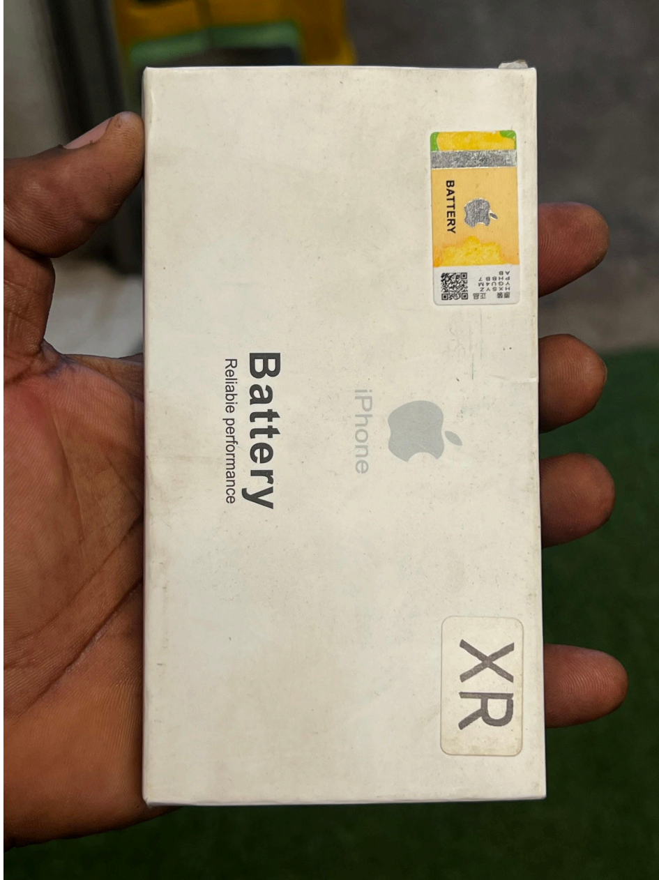
A sample of iPhone XR batteries I need