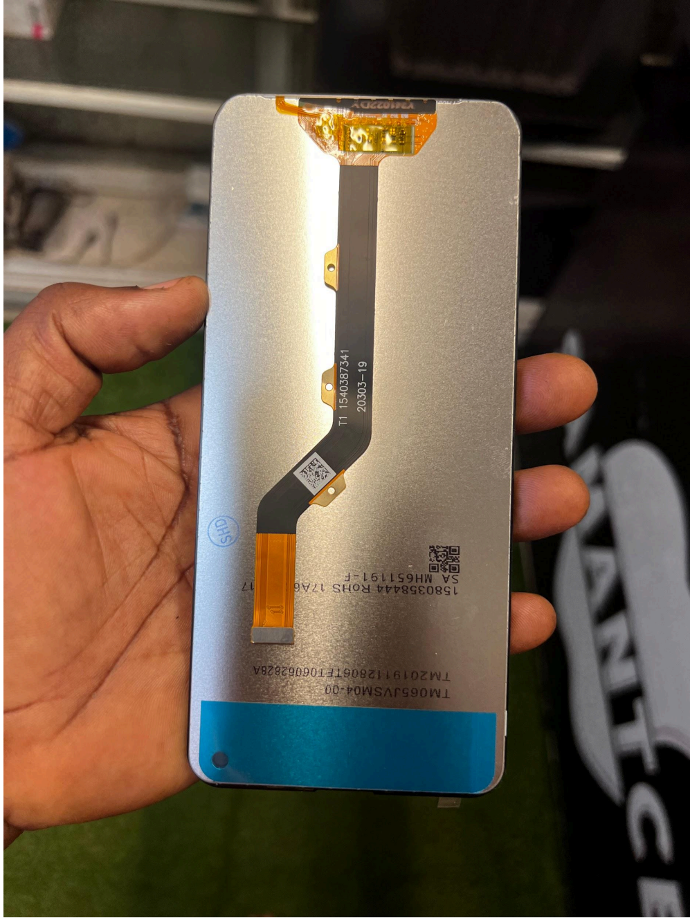
A sample of Infinix KD 7 LCD or screen replacement I need