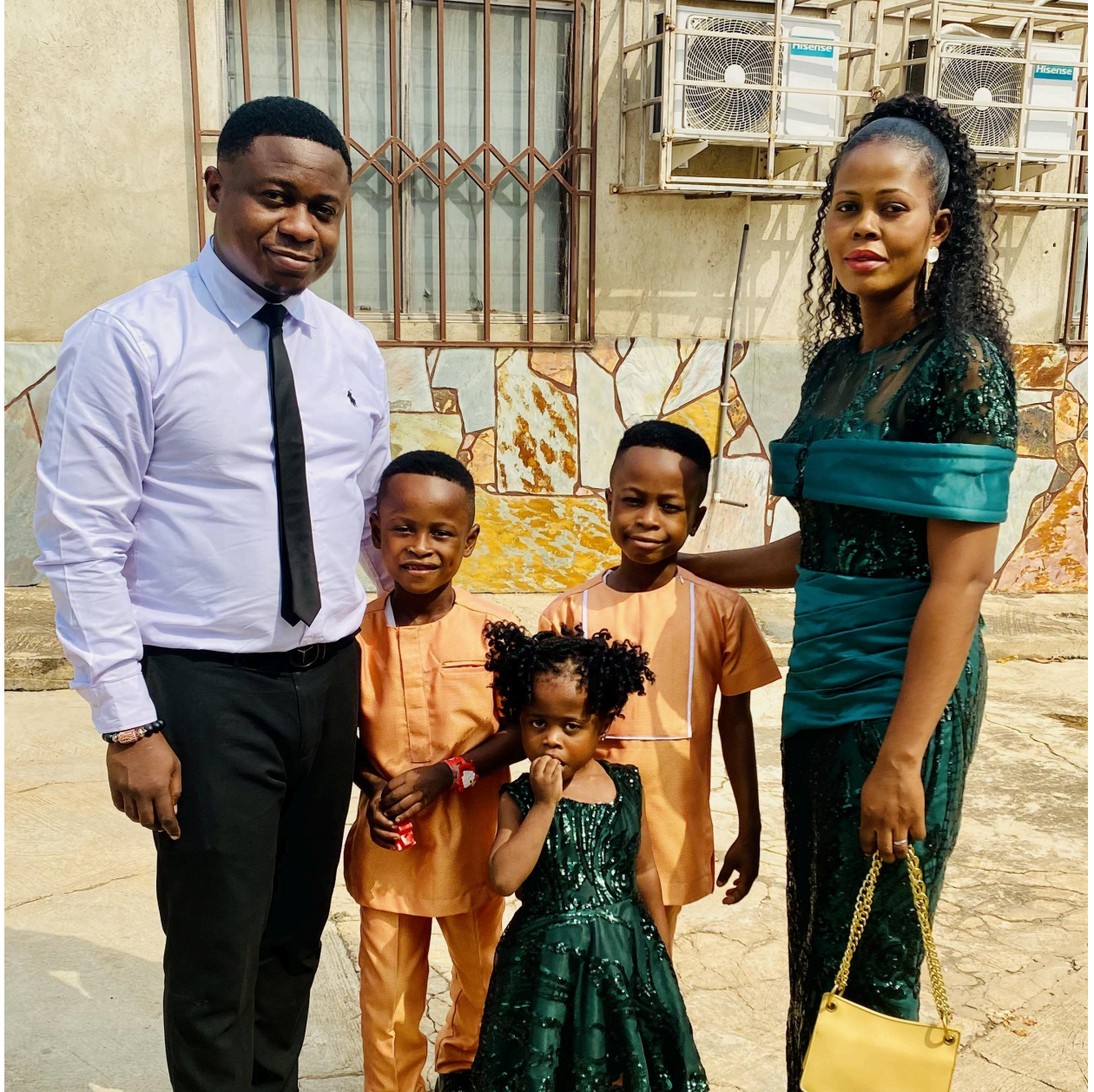
Married to Rejoice Dotse. A trained teacher Three children ages 7,6 and 4