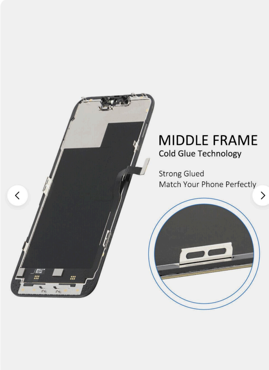
A sample of iPhone 13 mini LCD or Screen replacement