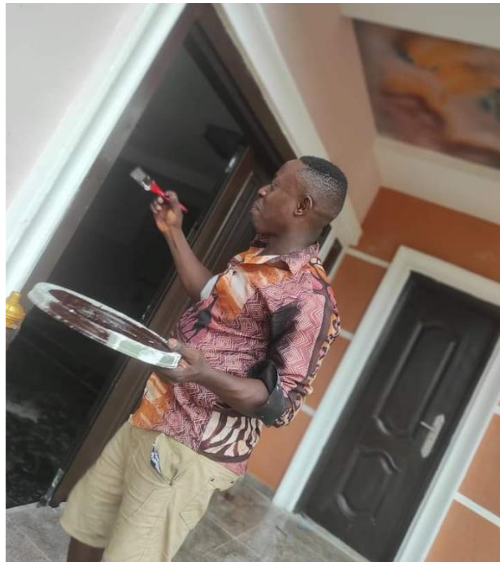
GOSPEL: PRODUCTION MANAGER